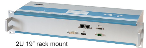
2U 19" rack mount