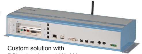
Custom solution with PCI extension and WLAN