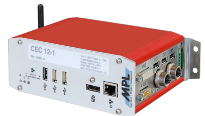
Solution with M12 (EN 50155)