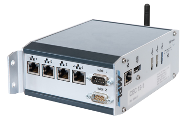
Standard solution with WLAN