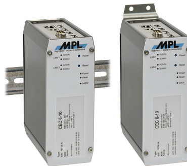
Standard housing with DIN-Rail & Flange mounting

In case of special needs any RAL color can be used for your OEM case. The MIL Outdoor housing comes in Jet Black (RAL 9005) but other RAL colors are possible as well.