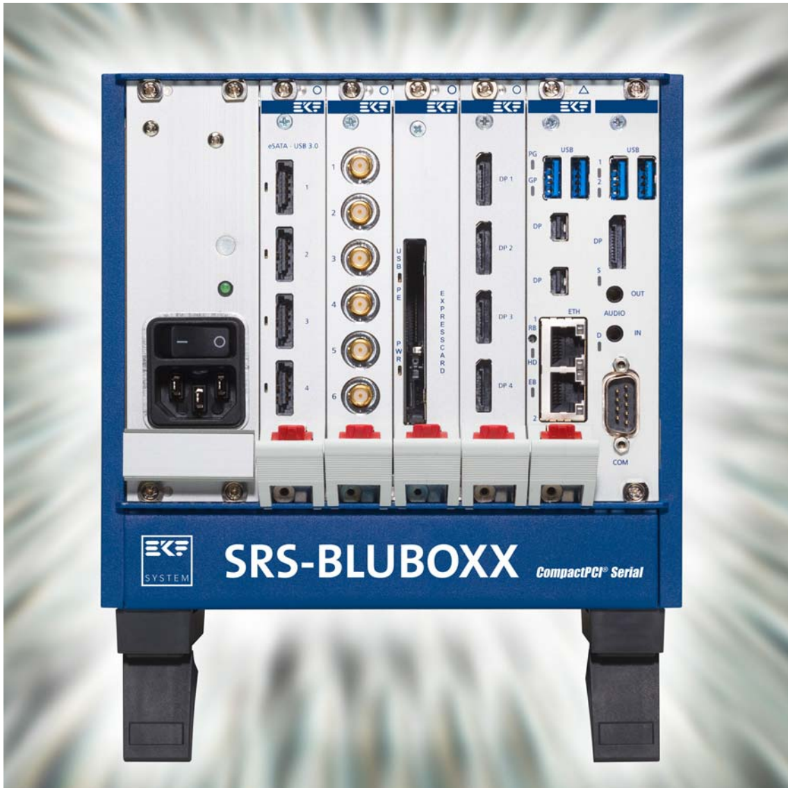
Typical System Configuration